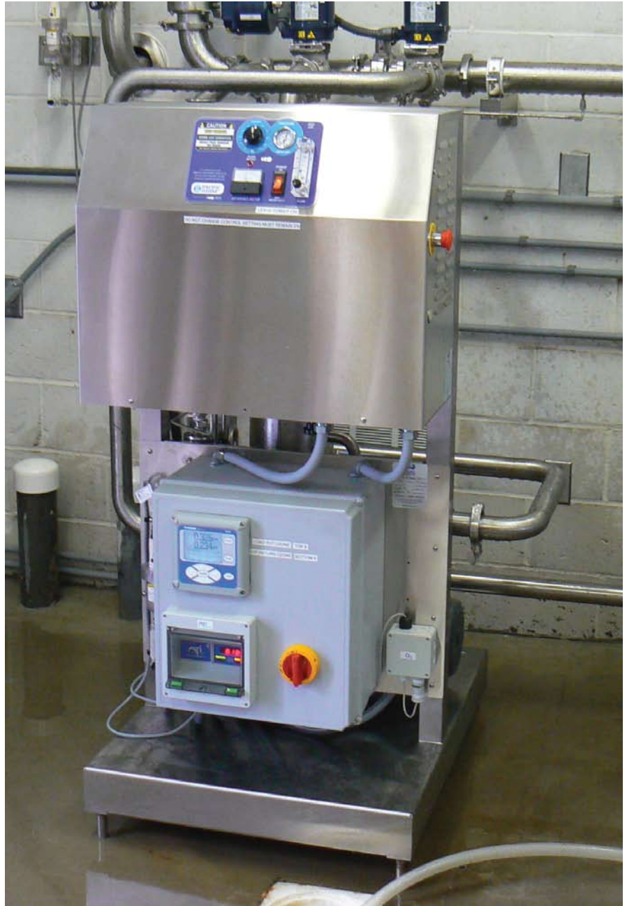
An SGC22 Ozone Generator System powers a Horizon 060 Integrated Ozone System at a remote spring water collection site.

The onboard oil-less air compressor of the SGC Series, provides needed compressed air to the system when plant air is unavailable or insufficient. The compressor feature allows the SGC Series generators to be installed in a wide range of locations and environments – wherever needed.